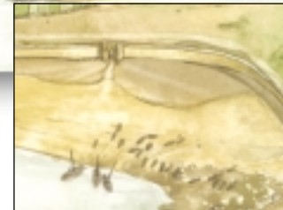
Sandwell Gate was built at the end of the 14th Century, some 60 years after the town wall was first constructed. Did local fishermen ask for easier access to the sea?