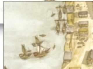
In 1346 five ships from Hartlepool joined Edward III's royal fleet. They took part in the capture of Calais during the Hundred Years War against the French.