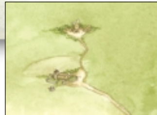
St Helen's chapel lay just outside the town wall. Documentary evidence suggests there was also a well and a windmill close-by.