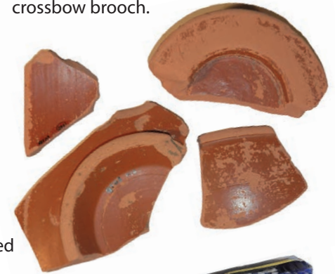
The pottery included Samian ware from Gaul (right) and vessels such as amphorae, which would have been imported from Spain filled with olive oil.