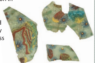
High status items included fragments of a beautifully crafted polychrome glass dish which came from Egypt.