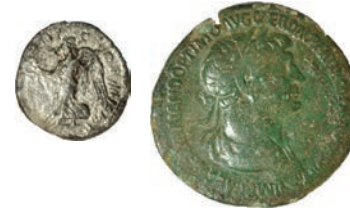
Coins - (left) relief of the goddess Victory on the back of a Denarius, AD196-7, (right) the head of the Emperor Trajan, on a Sestertius, AD114-7 - both of which were minted in Rome.