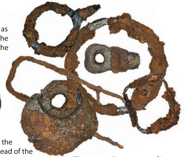
There was a large group of iron farming and wood-working tools.