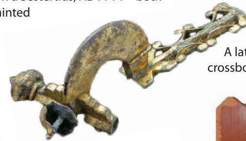
A late Roman gilt bronze crossbow brooch.