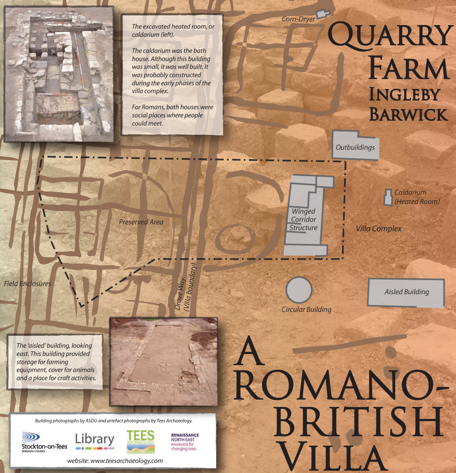
The 'aisled' building, looking east. This building provided storage for farming equipment, cover for animals and a place for craft activities.

For Romans, bath houses were social places where people could meet.