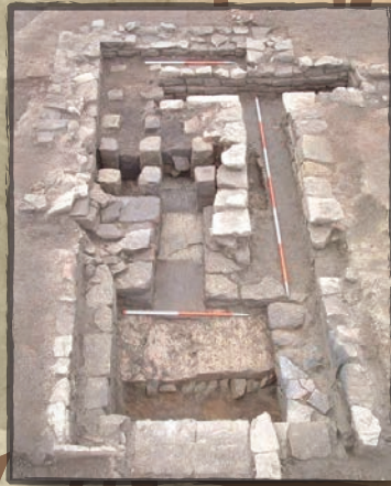
The excavated heated room, or caldarium (left).

A new farmhouse was built at Quarry Farm, but was demolished to make way for the current housing estates of Ingleby Barwick. It was the archaeological investigations which were carried out during the housing development which uncovered the long and continuous settlement of this part of the Tees Valley.