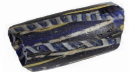
Jewellery included items like this Roman glass bracelet - a type which is particularly common in northern England.